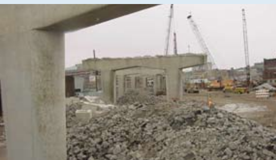
Milwaukee's Park East neighborhood after two freeway ramps came down in 2004.

In Milwaukee, residents of the Park East neighborhood worked with the city to make sure that when two downtown freeway ramps were demolished, the land would go to a high-density, mixed-use development including affordable housing and mass transit. The Community Benefits Agreement the residents signed with the city also included a commitment to green building and good labor standards both for construction workers and for those who will ultimately work in the development's commercial buildings. The Park East CBA, including legislative language, can be found at www.wisconsinfuture.org/workingfamilies/econdev/index.htm . For more information on community benefits agreements generally, see www.communitybenefits.org .