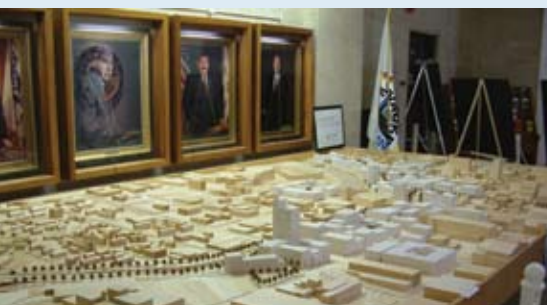
New development plan for Park East, put together by neighborhood residents and city planners, including affordable housing, transit, green building principles and high-wage job guarantees.